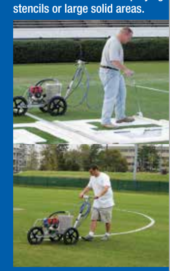
Easily paints circles and arcs.

Introduced in 2004, the original FieldLazer $100 was the first walk-behind field marker utilizing proven Graco high-pressure airless paint spray technology. It is now recognized by field marking professionals as one of the top walk-behind field marking machines available.