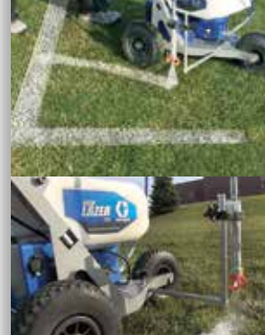
Easy 3 Wheel Design to