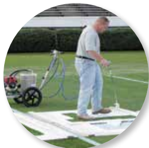
No-tool gun removal for spraying stencils or large solid areas.