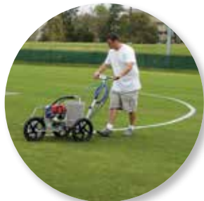
Easily paints circles and arcs.