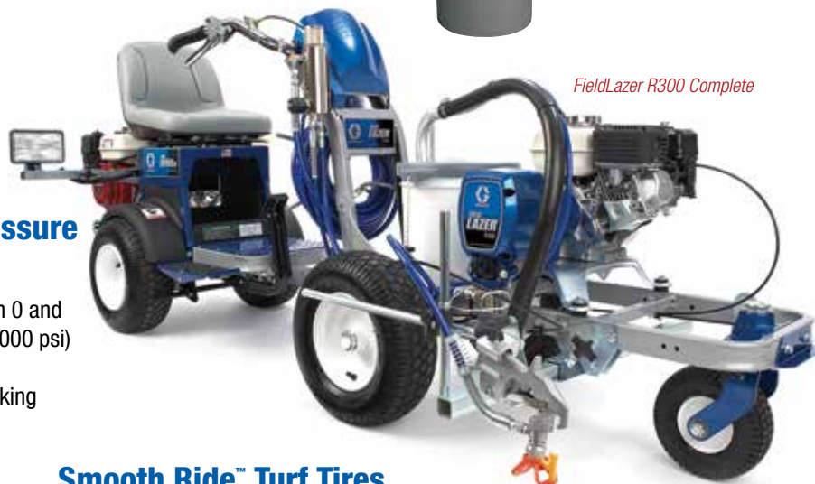
FieldLazer R300 Complete