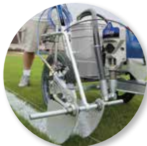
Designed to deliver long straight lines